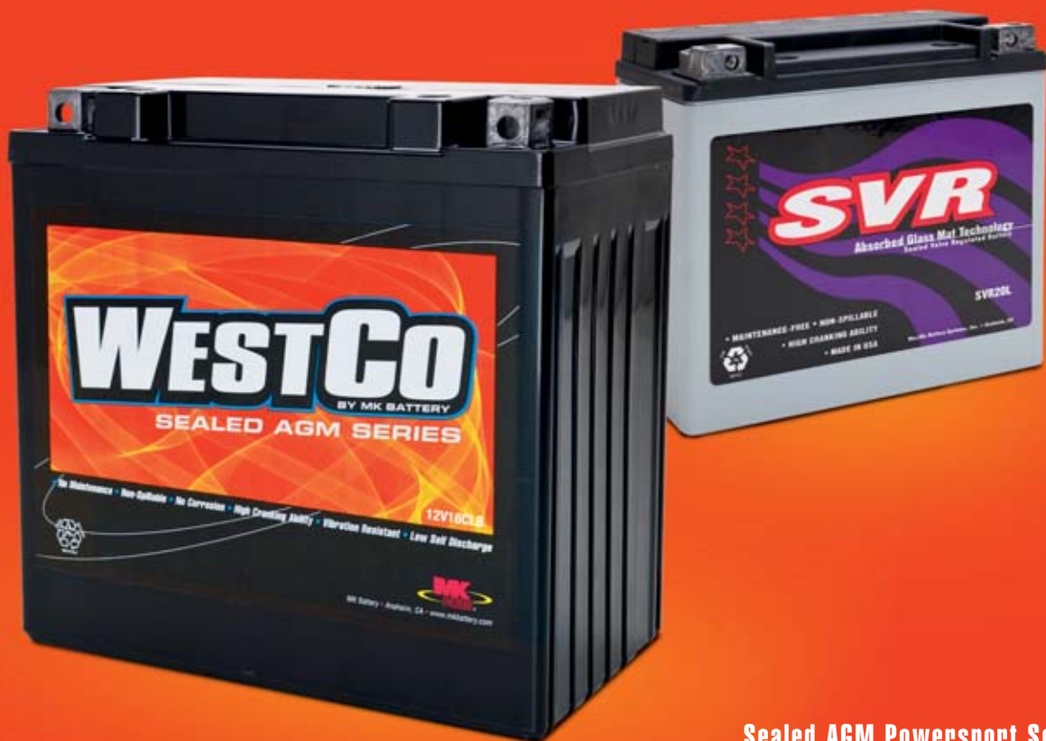
Sealed AGM Powersport Series